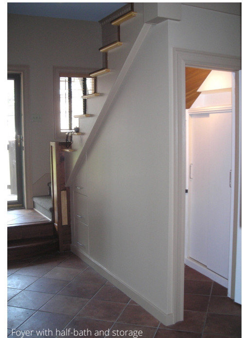
Foyer with half-bath and storage