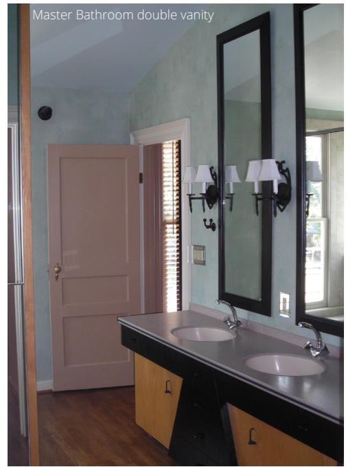
Master Bathroom double vanity