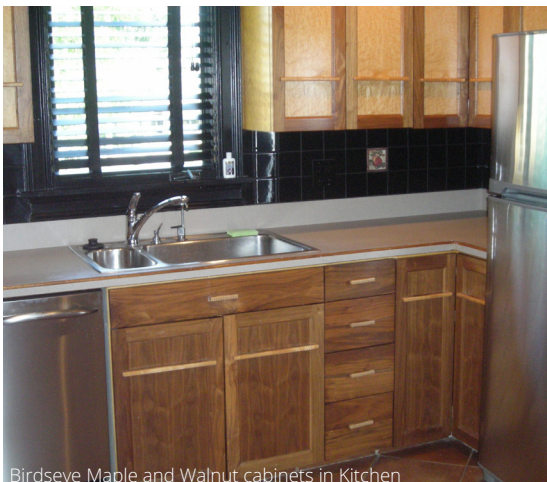
Birdseye Maple and Walnut cabinets in Kitchen