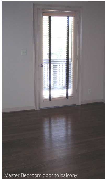
Master Bedroom door to balcony