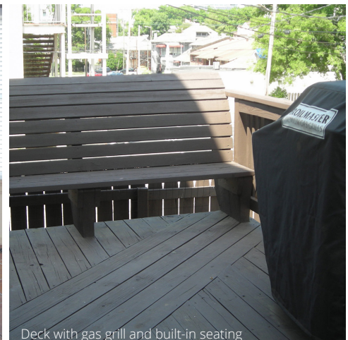
Deck with gas grill and built-in seating