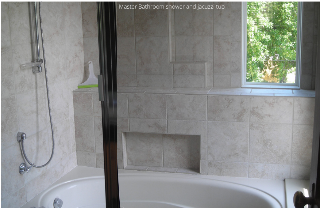
Master Bathroom shower and jacuzzi tub