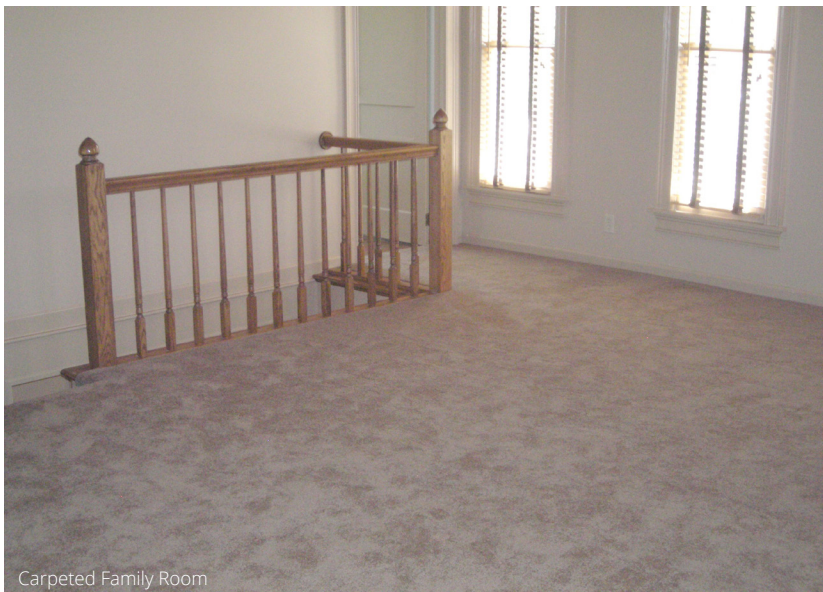
Carpeted Family Room