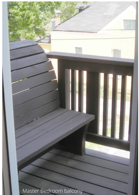
Master Bedroom balcony